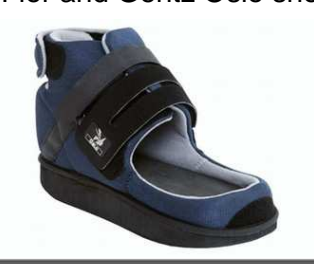
Fior and Gentz Oslo shoe