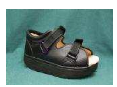
Sunrise Footworx H-fit