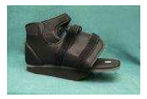
Heel reliever shoes