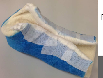
Figure 9: Scotchcast boot with window