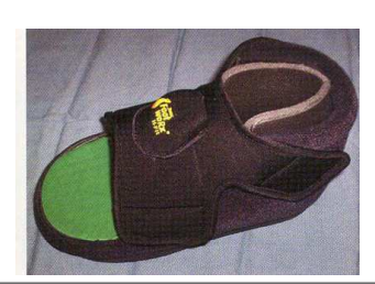
Sunrise Footworx H-fit